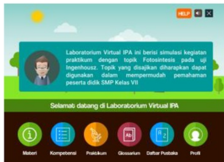
Figure 1. Home page menu